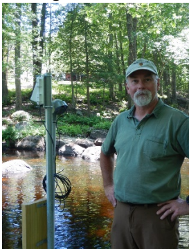
Example of a flow data collection set-up

This spring, NHDES personnel will be installing flow gages into the five tributaries to gather baseline data about river height and flow. Researchers will try to find correlations between observed flows in the tributaries and flows in the lower Lamprey. They can begin to tackle trickier questions about riverside habitats, the needs of fish communities and long-term flow data to serve as a basis for future management.