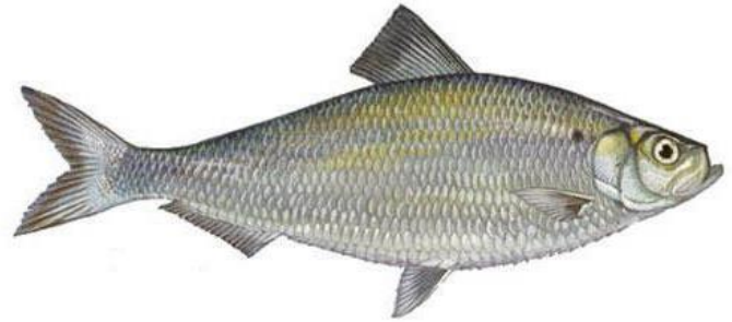
alewife Alosa pseudoharengus

After two years without our annual river herring celebration due to Covid concerns, Herring Aid will return this spring when the river herring head back from the ocean to their birth places upstream to spawn the next generation.